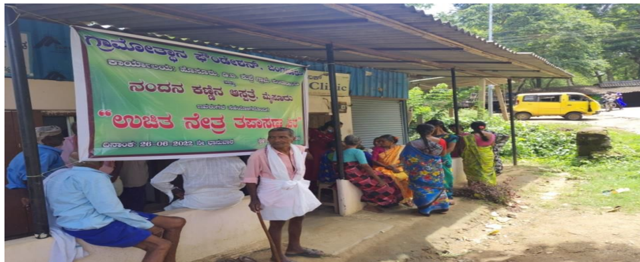
Eye Check up at the villages