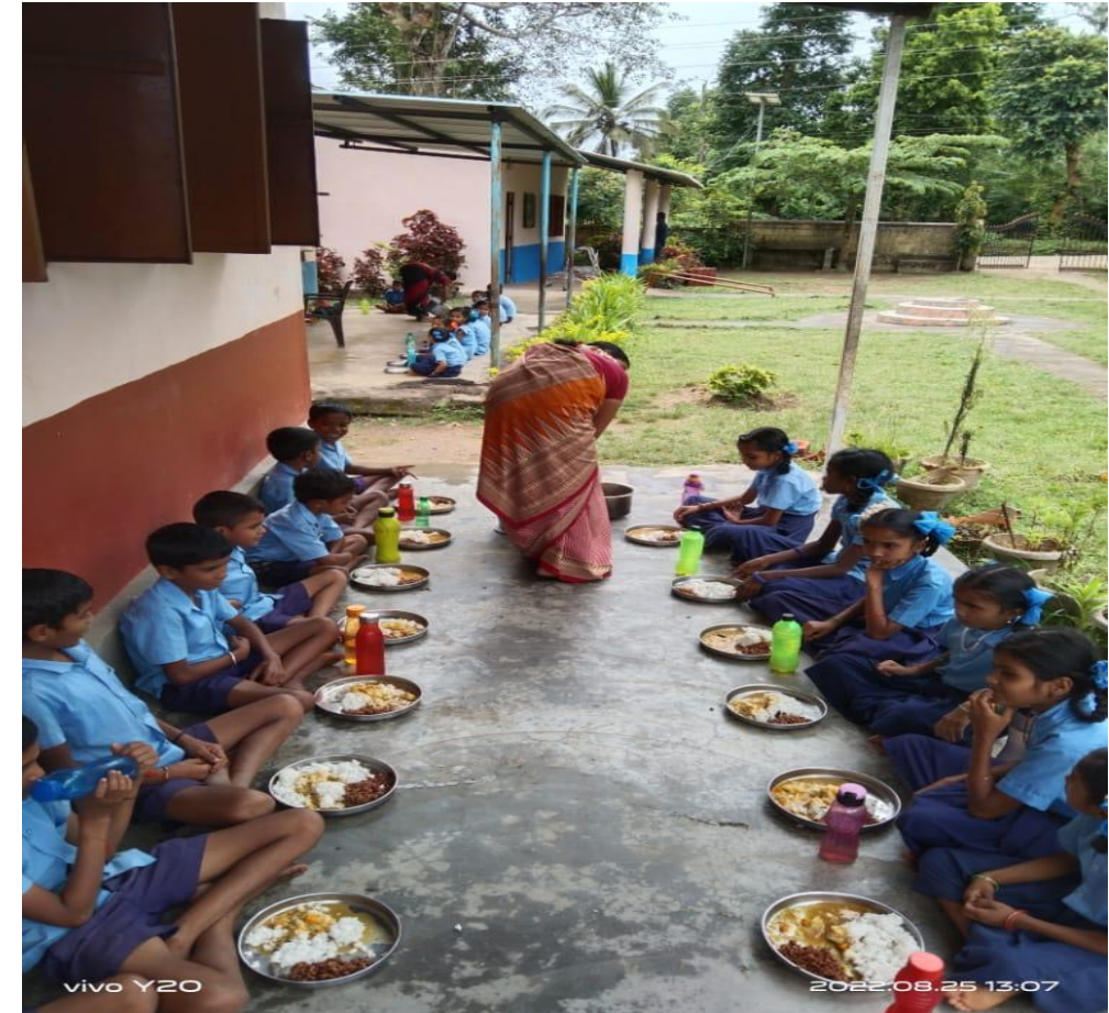
Mid day meals with pulses