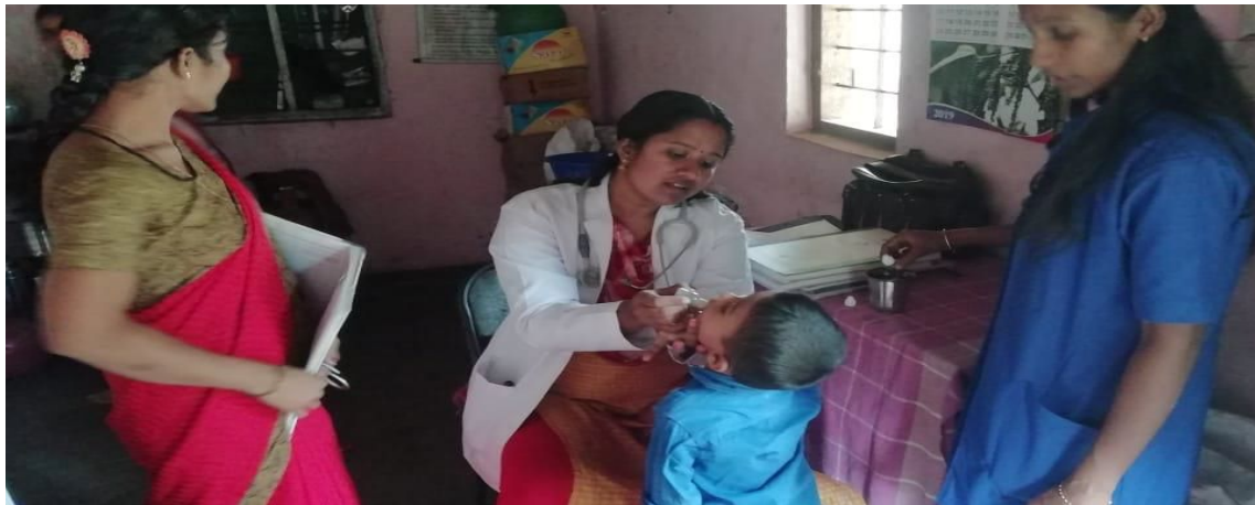
School Health Check up