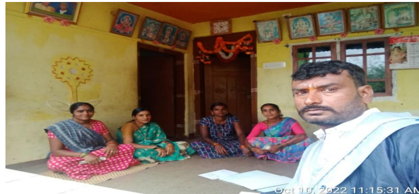
Distribution of Health Cards