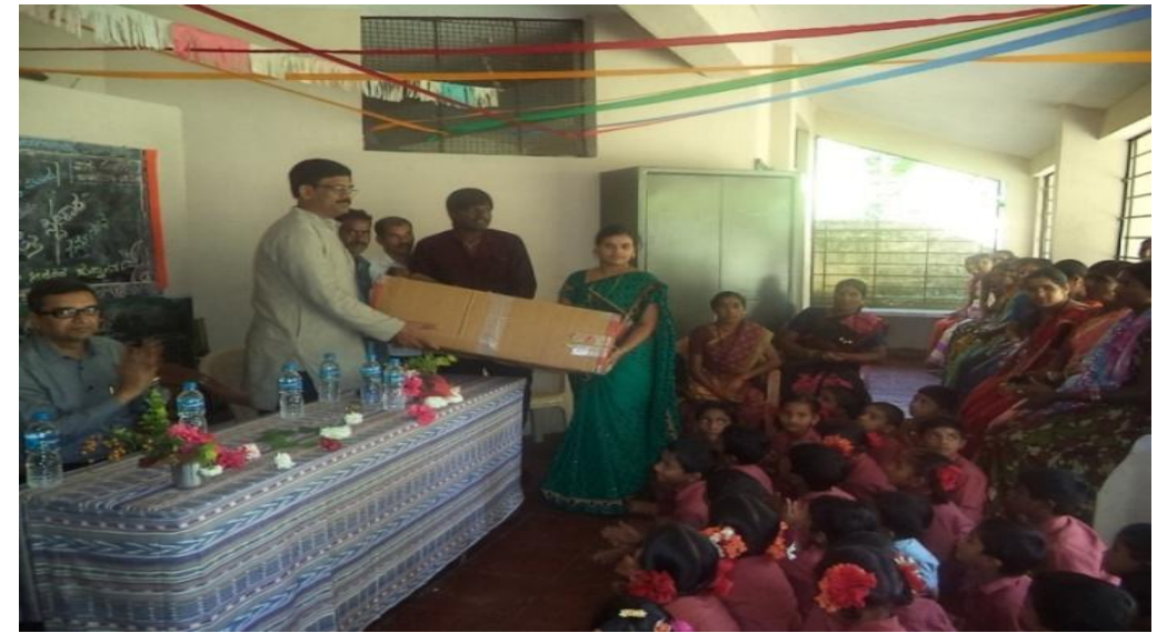
Sports material distribution