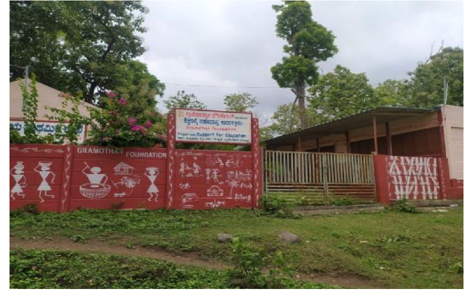
Construction of school at bhogapura