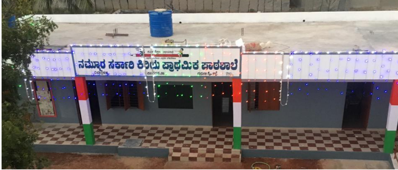
New School constructed with 4 classrooms, kitchen, toilets and a playground in Pavagada Taluk in Tumkur Dist.