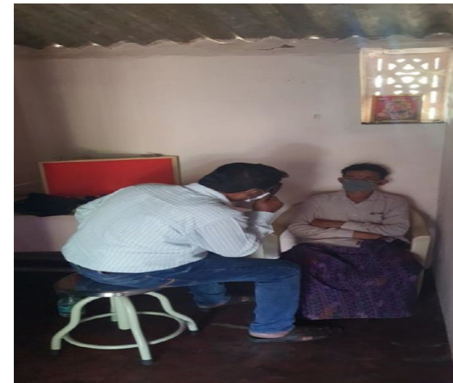
Health initiatives Contd.,