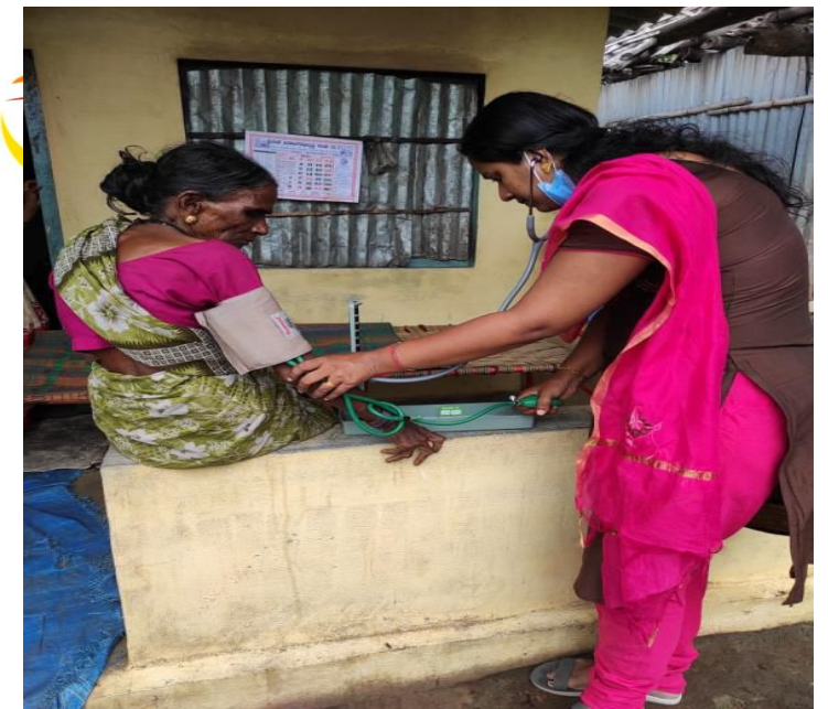
Old age Health Checkup