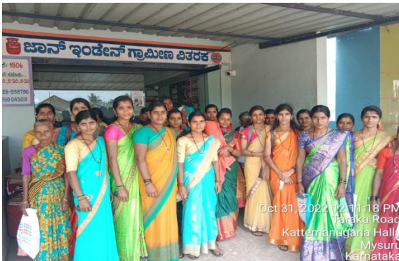
Subsidised gas cylinders

GF has undertaken Govt. projects like construction of houses and toilets.