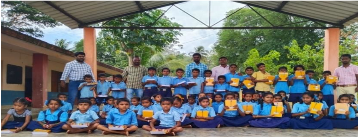
Distribution of Note books & study materials