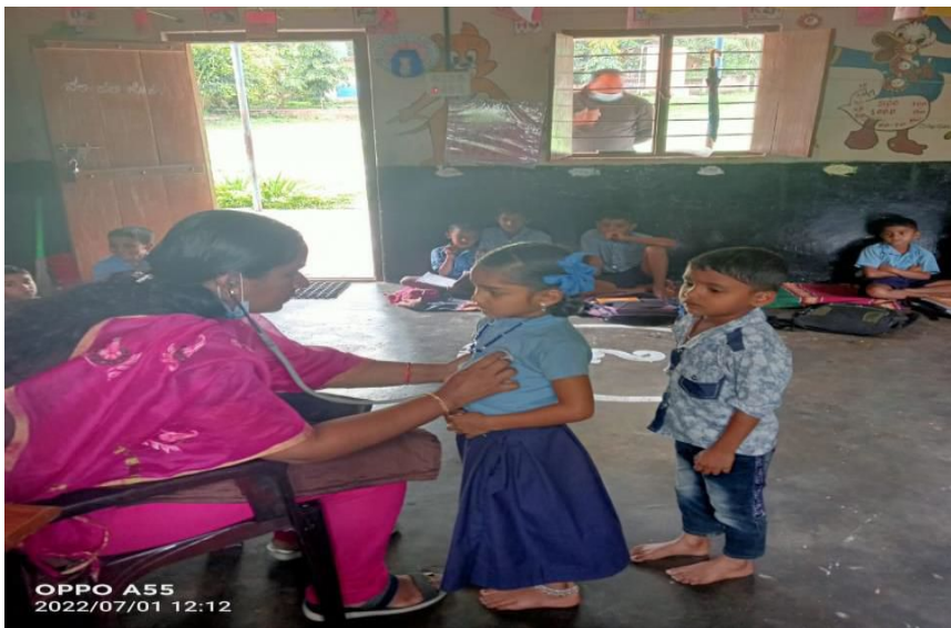
School Health check up