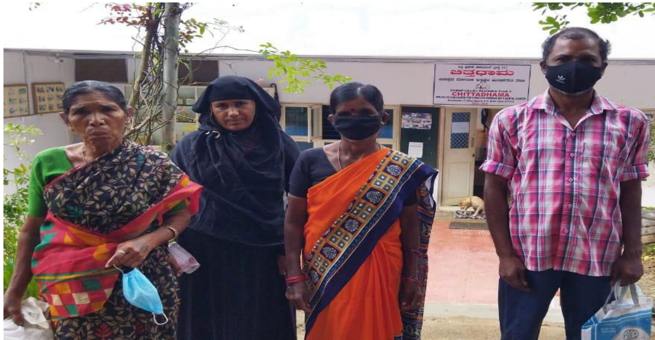
Health check up for mentally retarded