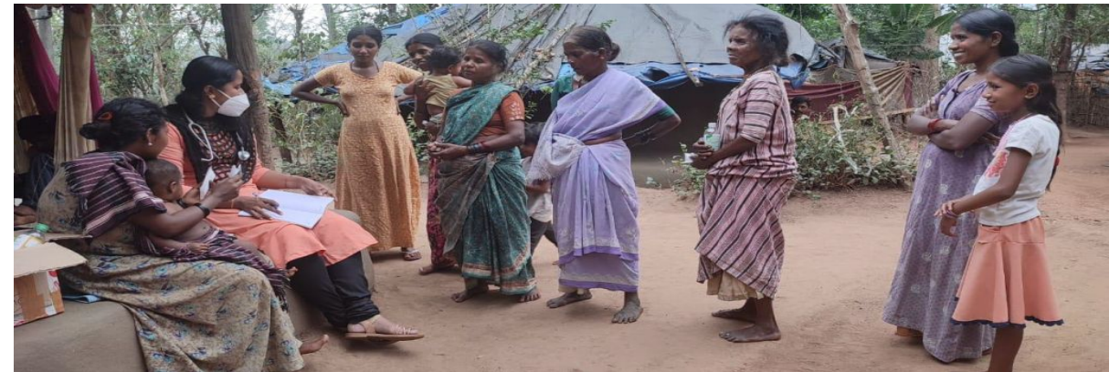
Tribal Health Check up