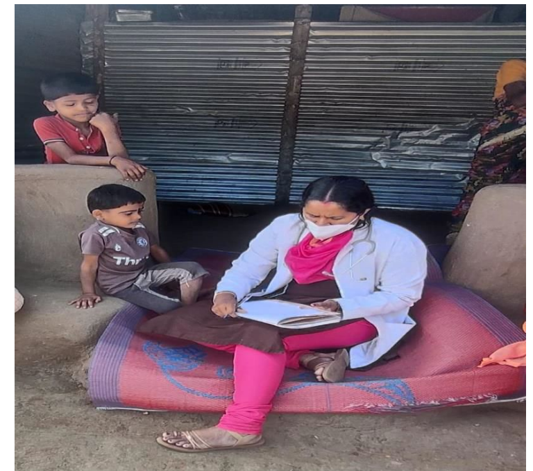
Anganwadi health check up