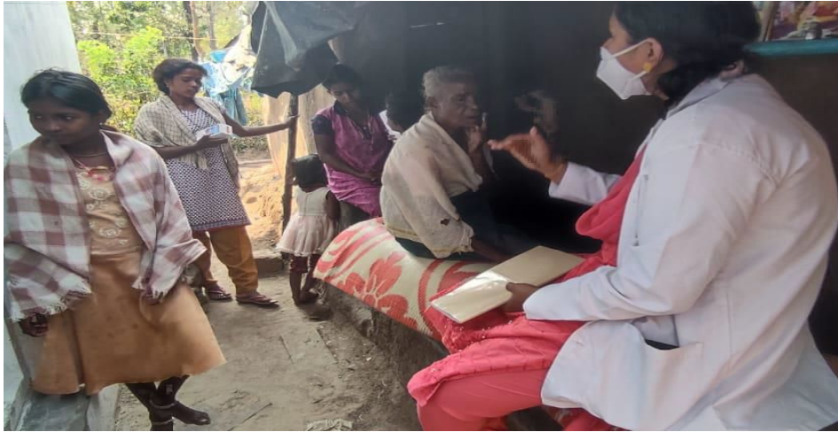
Village Health Check up